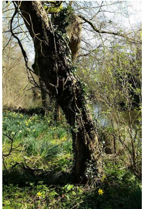
Bliss was it that dawn to be at Woodbrooke...